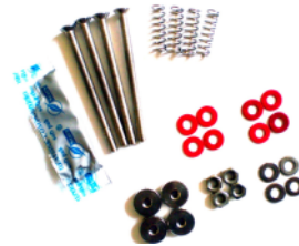
different accessories included in delivery