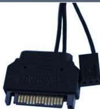
SATA power with 3 pin monitoring