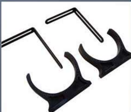
Pump holders with HDD cage brackets

Please pay attention to marked "IN" and "OUT" on the CPU top cover and connect with other components accordingly.